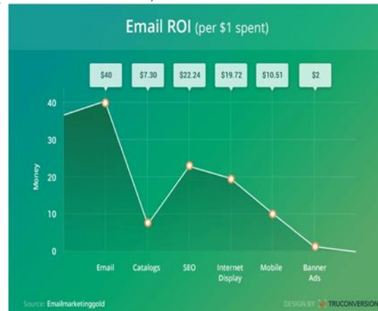
Figure 2. Graphs on the profits earned from some marketing media.

The graph is one proof of the benefits of email marketing in getting the attention of consumers so that consumers feel like to buy products or services offered by the business. And on the graph below that obtained from emailmarketing.go.id, it is clear that marketing by using banners is very ineffective and inefficient, because it requires a lot of costs, but cannot attract the attention of consumers (Figure 2).